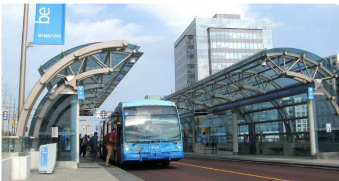
Ontario's York Regional Transit VIVA BRT

The second flaw is the continued suggestion that because Light Rail is a railway with tracks, it creates “permanence” and is more attractive. Bus Rapid Transit, or BRT, can receive the same “permanence enhancements” such as branding, way-finding information, landscaping, lighting, and a dedicated right-of-way. BRT can be equipped with sheltered stations/stops that have wait-time displays, off-board payment, seating and other useful amenities which add comfort and ambience, just like on an LRT.